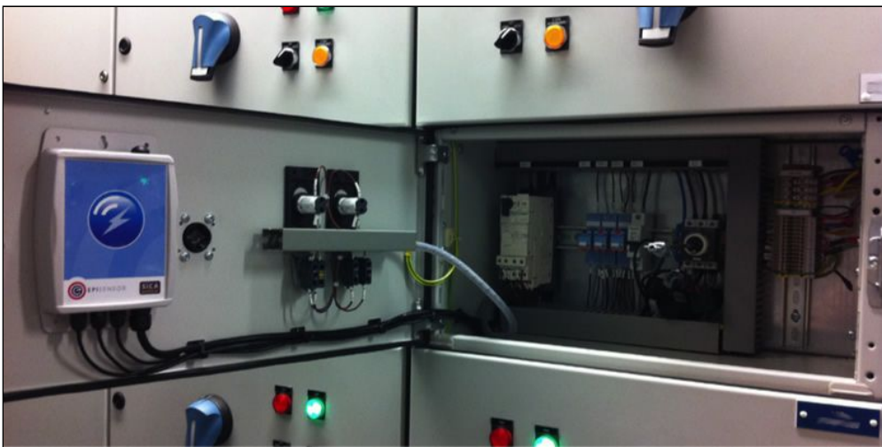
EpiSensor meter installed in an electrical distribution board

The product comes pre-calibrated to Class 1 accuracy (+/- 1% of the actual value) and paired with a set of current transformers, is fully water and dust-proof and has integrated ZigBee wireless communications. The figure below shows a typical installation with the EpiSensor ZEM-6X meter installed inside an electrical distribution board.