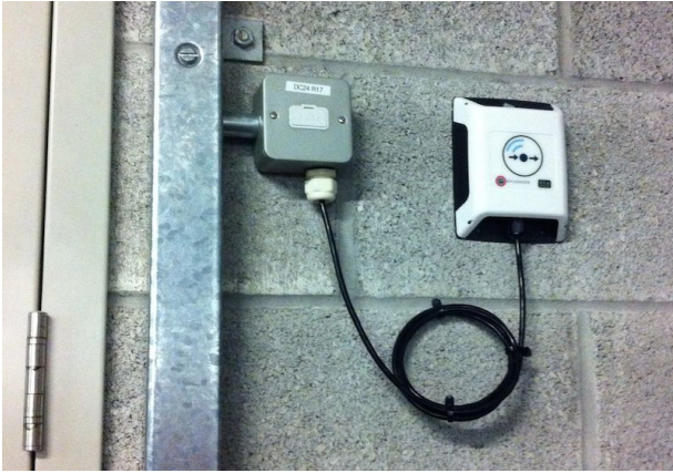
EpiSensor Range Extender, used to boost the wireless signal strength