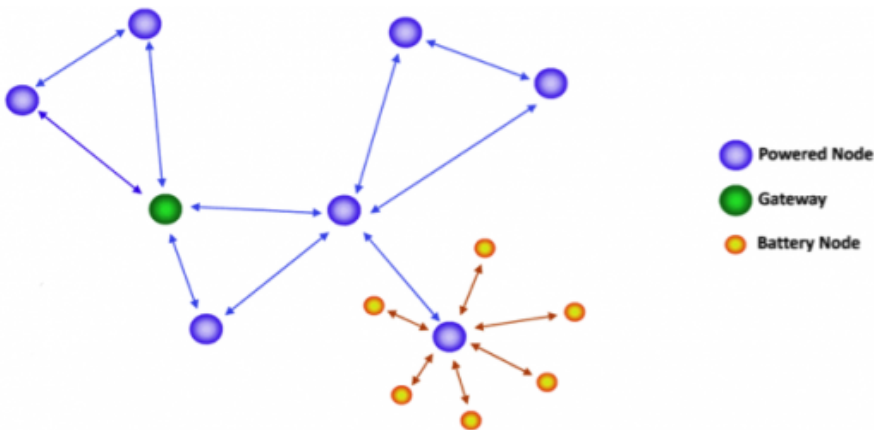
EpiSensor mesh network topology

Each wireless "node" needs only to communicate with the next closest mains powered device on the network - as opposed to a "star" network, where every device needs to connect back to a central location.